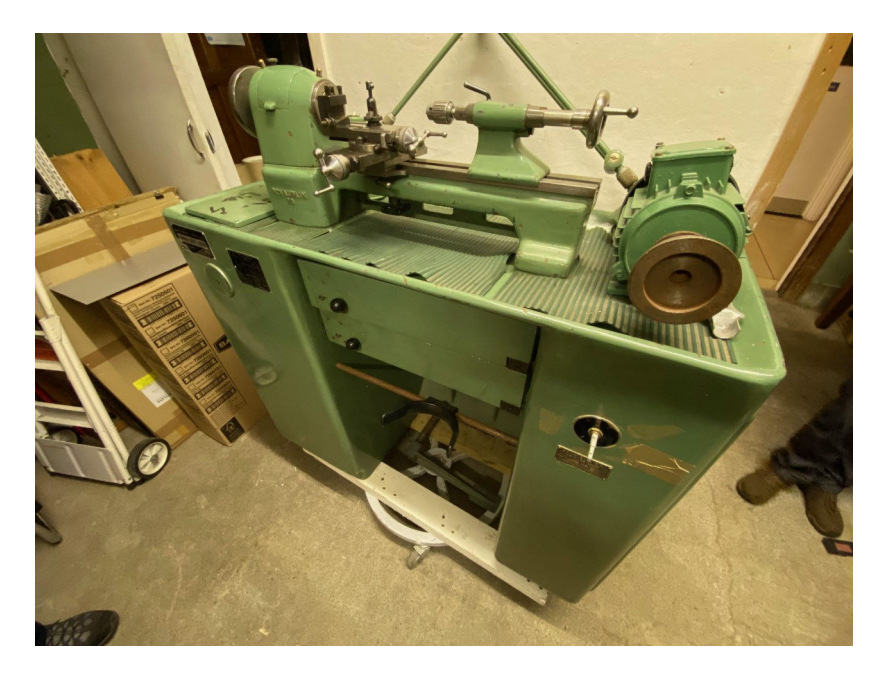
CHANGE OF VENUE FOR MAY MEETING