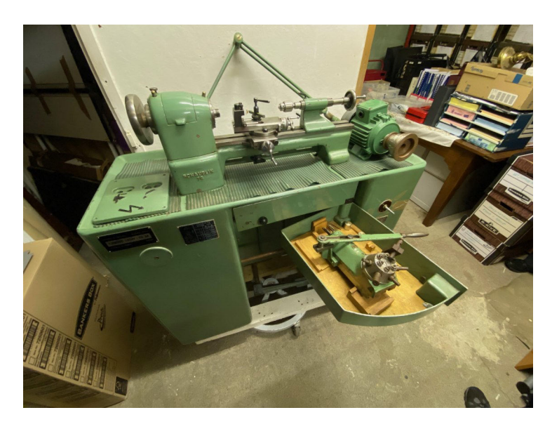
CHANGE OF VENUE FOR MAY MEETING

It is potentially a valuable machine to someone with the knowledge and resources to complete it, if there is more than one person interested then we will be looking for higher offers. James Marten. 07917226598.